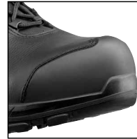
HAIX® Composite Toe Cap