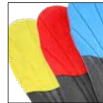
HAIX® Vario Wide Fit System