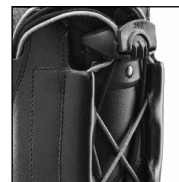
HAIX® FL Fit System