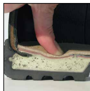
HAIX® MSL System