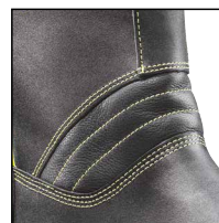
HAIX® AF System